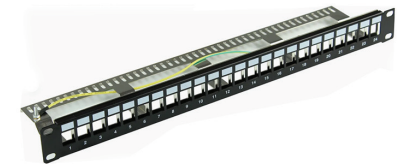
FTP Blank Patch Panel 24 Port with Back Bar